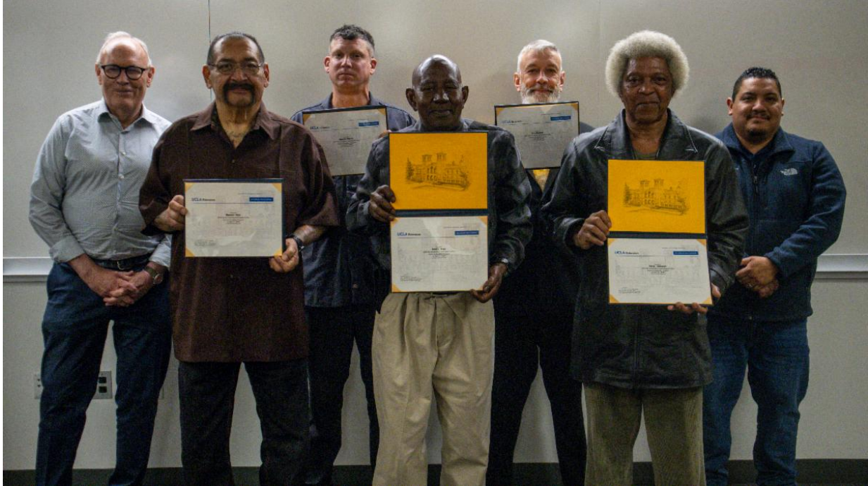
Five Veterans graduated from UCLA Extension's Success Academy on April 11th. The 6-week course focuses on professional communication, emotional intelligence, and career-finding skills and resources.